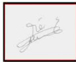
Fig(b) A Grayscale Image

A grayscale image is a data matrix whose values represent intensities within some range where each element of the matrix corresponds to one image pixel.