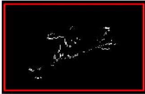
Fig. 1.2: Binary Image interpreting the bit value of 0 as black and 1 as White Features Extraction is the key to develop an offline signature recognition system. We use a set of five global features that cannot be affected by the temporal shift.

Any image when resample is filtered by a low pass FIR filter. This is done to avoid aliasing. This aliasing occurs because of sampling the data at a rate lower than twice the largest frequency component of the data. So a lowpass filter will remove the image high frequency components. And for this purpose the filter used. Now the grayscale image is segmented to get a binary image of objects. In a binary image, each pixel assumes one of only two discrete values: 1 or 0. A binary image is stored as a logical array.