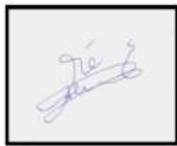
Fig(a) A sample signature

The true color image RGB is converted to the grayscale intensity image by eliminating the hue and saturation information while retaining the luminance.